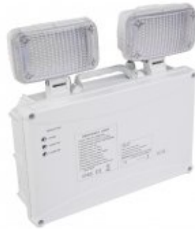
TWS IP65 L7