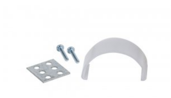
Serial joining kit