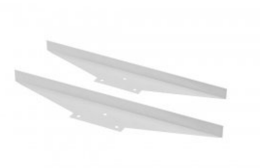
Serial Curve brackets