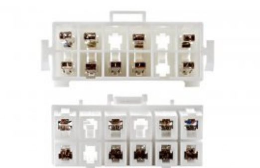
9 pole connector blocks.