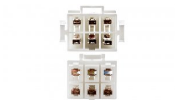
6 pole connector blocks.