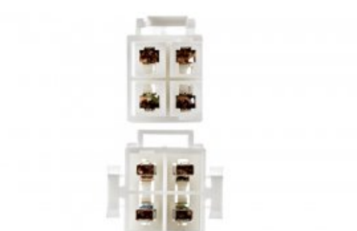
4 pole connector blocks.