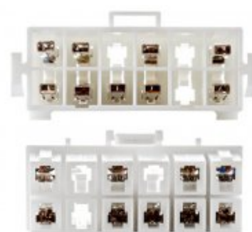
9 pole connector blocks.