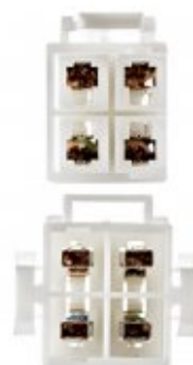
4 pole connector blocks.