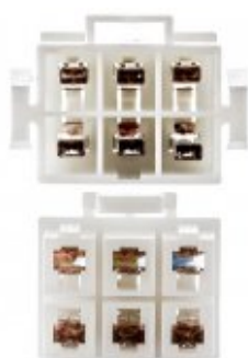
6 pole connector blocks.