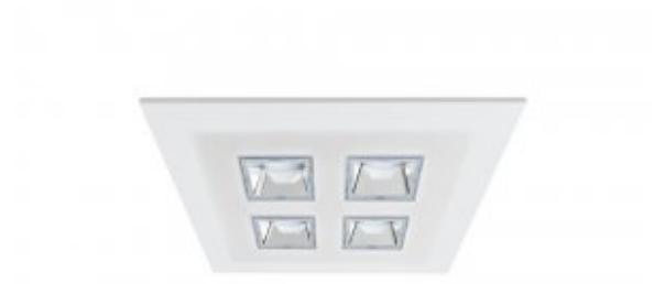
Rubix 4 Pull Up Kit