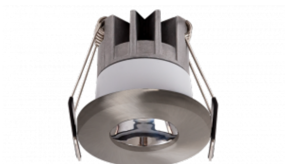
Protec Micro Chrome