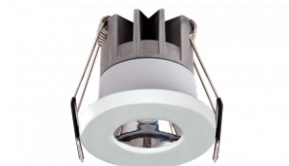
Protec Micro White