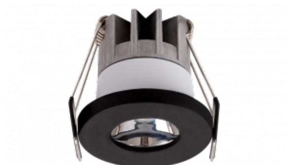
Protec Micro Black