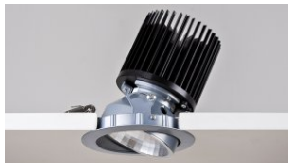
Pro-Light Mini Circular Grey