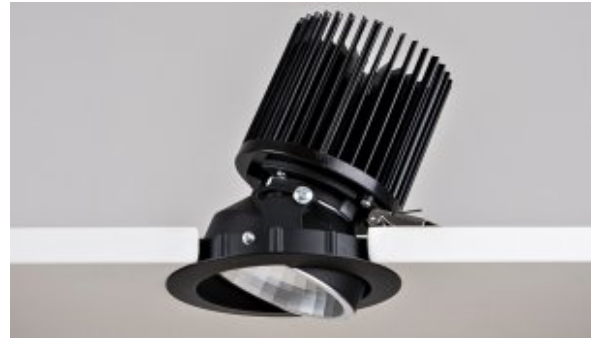
Pro-Light Mini Circular Black