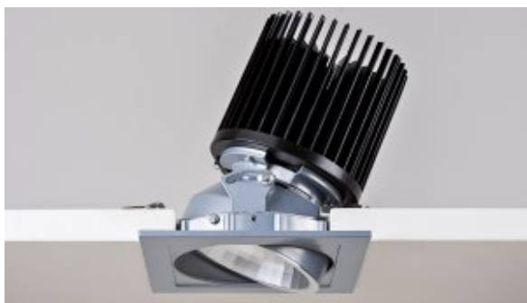
Pro-Light Mini Square Grey