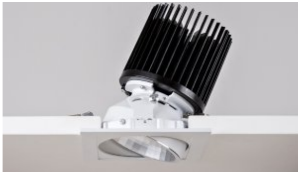
Pro-Light Mini Square Semi Specular White