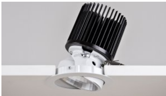
Pro-Light Mini Circular Semi Specular White