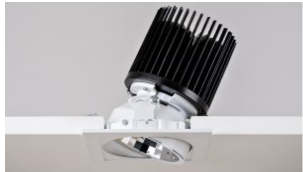
Pro-Light Mini Square Specular White