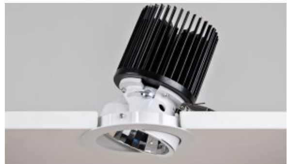
Pro-Light Mini Circular Specular White