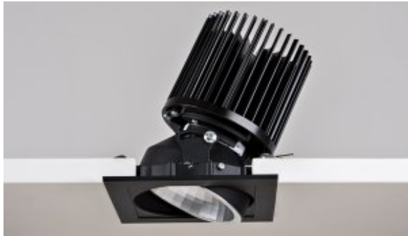
Pro-Light Mini Square Black