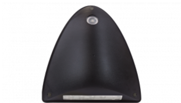
Opus Wallpack Black