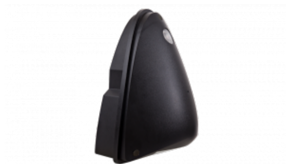
Opus Wallpack Black