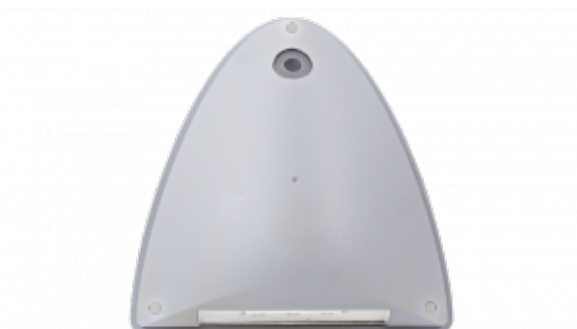
Opus Wallpack Grey