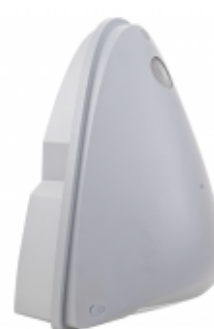
Opus Wallpack Grey