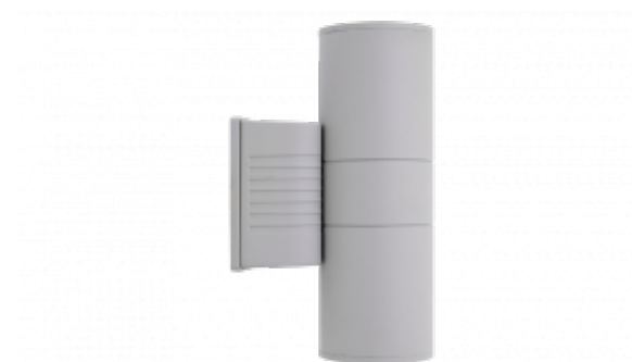
Opus Sconce Bi-Directional