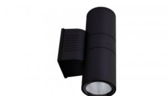
Opus Sconce Bi-Directional Black