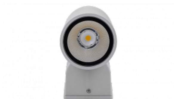
Opus Sconce Optic