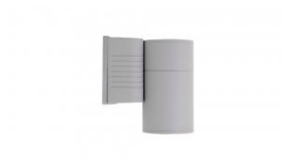
Opus Sconce Up or Down Light