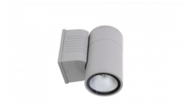
Opus Sconce Up or Down Light