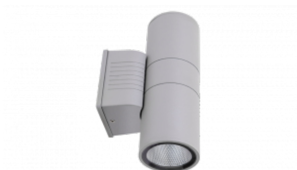
Opus Sconce Bi-Directional