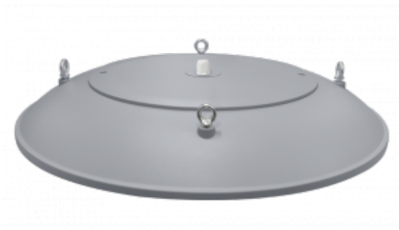
Opus Highbay Rear