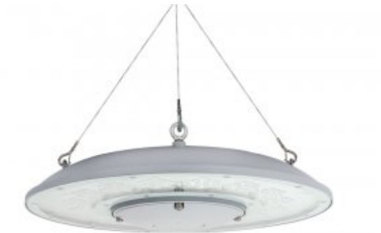
Opus Highbay Suspension