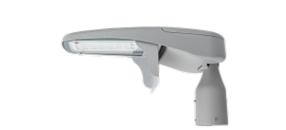
Opus Column Small Rear Baffle