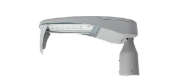
Opus Column Small Front Baffle