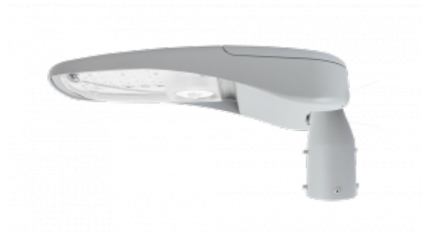
Opus Column Small Vertical Spigot