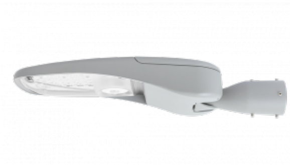
Opus Column Small Sensor