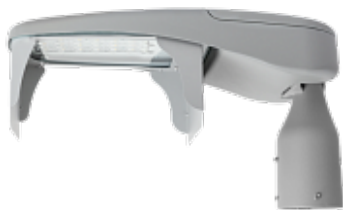
Opus Column Small Both Baffles