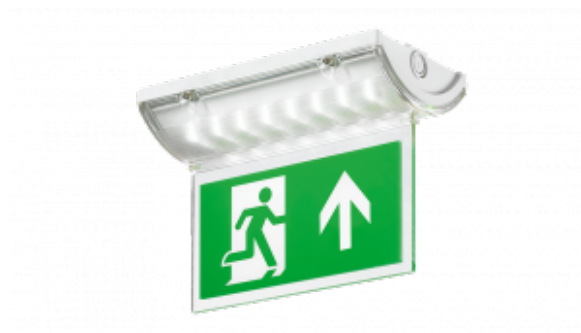
OEZ 2 with Legend