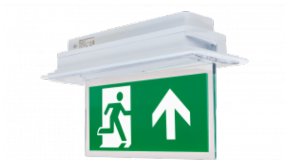
OAT2 With Legend