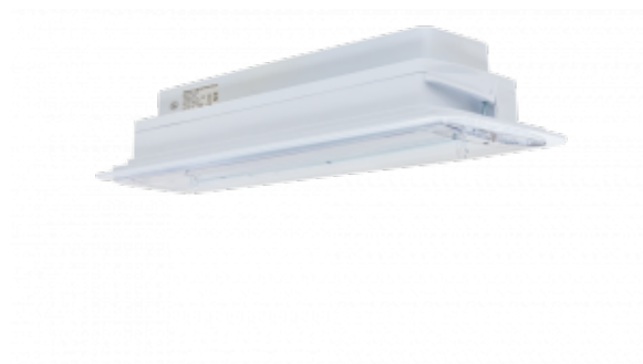
OAT2 Less Legend