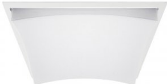
MOD Curve 600x600