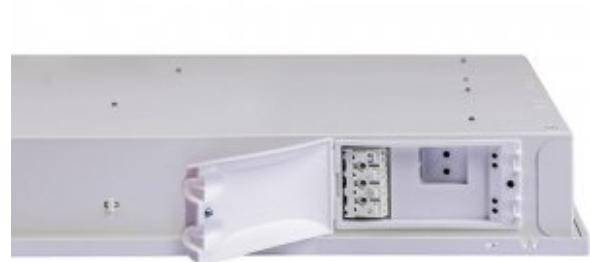
MOD Terminal Cover