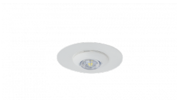
LED4 Wireless White