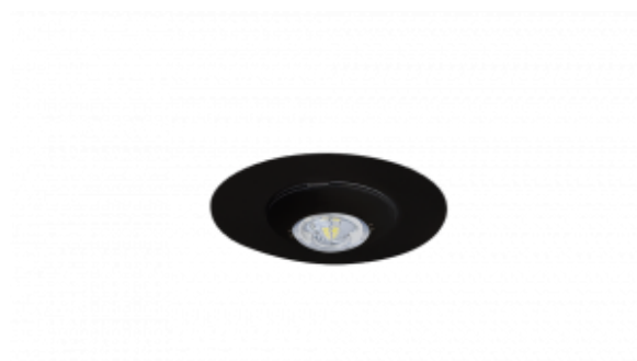
LED4 Wireless Black