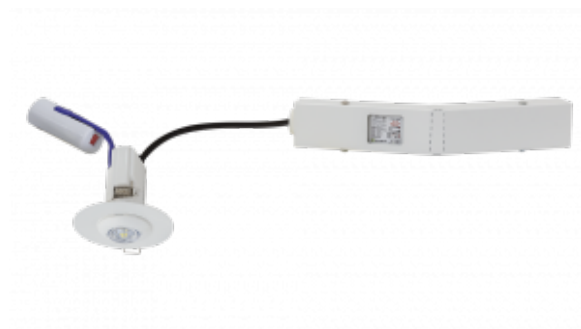
LED4 Wireless Remote Pack