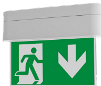
HBE Wireless Surface Mount