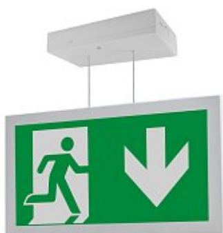
HBE Wireless Suspended