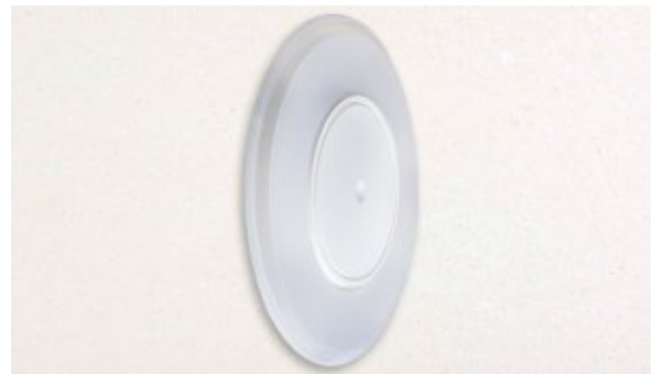
Halobay Surface Wall