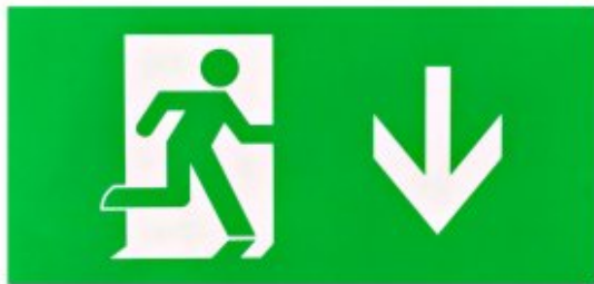
EXI3 DL ISO7010