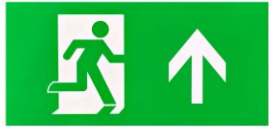
EXI3 UL ISO7010