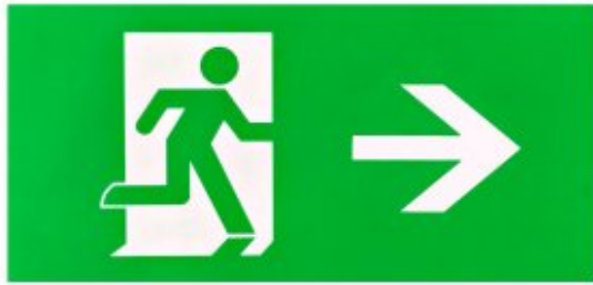
EXI3 RL ISO7010