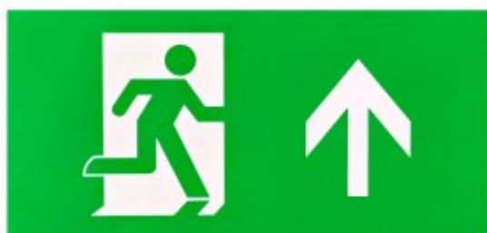
EXI UL ISO7010