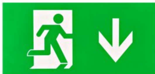
EXI DL ISO7010