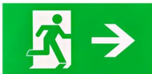
EXI RL ISO7010