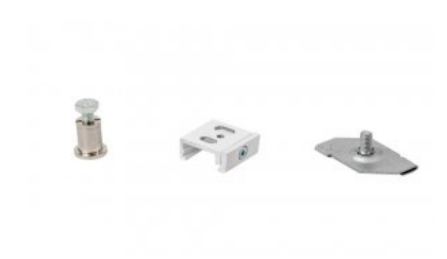
Suspension Kit T Bar Ceiling