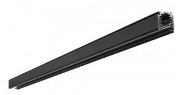
DALI Track Black