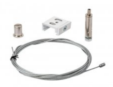
Suspension Kit Solid Ceiling