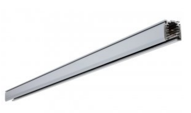
DALI Track Grey