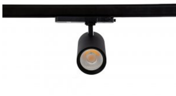
Coulis 70 Black