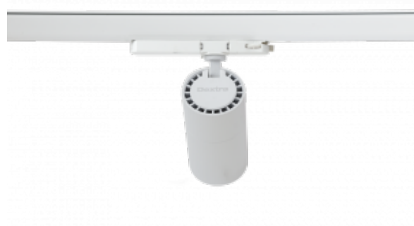
Coulis 70 White