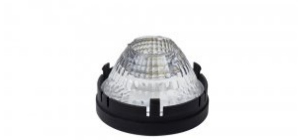
Coulis 70 Lens Kit