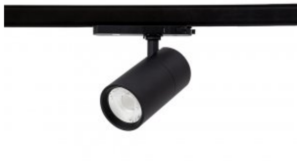
Coulis 70 Black