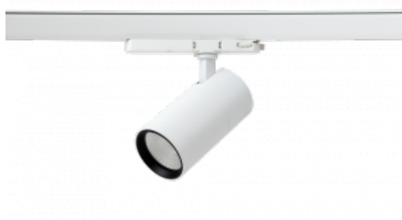
Coulis 70 White