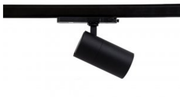
Coulis 70 Black