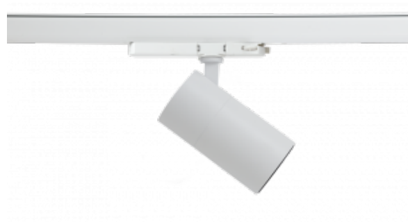
Coulis 70 White