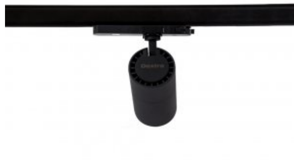
Coulis 70 Black