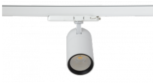
Coulis 70 White