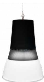
Capo XL Black Housing