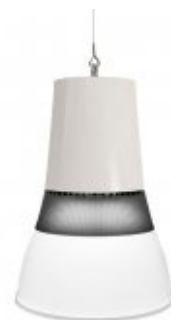
Capo XL White Housing