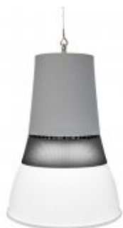
Capo XL Grey Housing