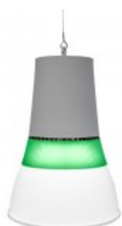
Capo XL Green Collar