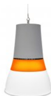
Capo XL Orange Collar