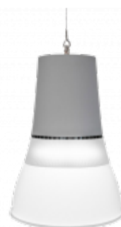
Capo XL Opal Collar