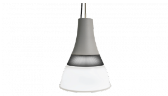
Capo Grey Housing