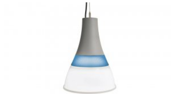
Capo Blue Collar