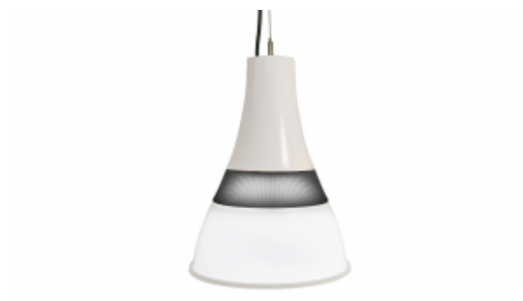
Capo White Housing