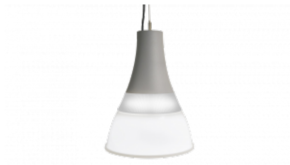
Capo Opal Collar