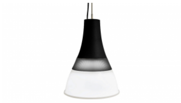
Capo Black Housing