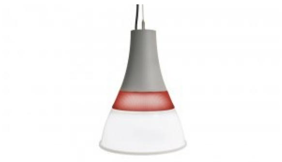
Capo Red Collar