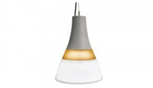
Capo Orange Collar