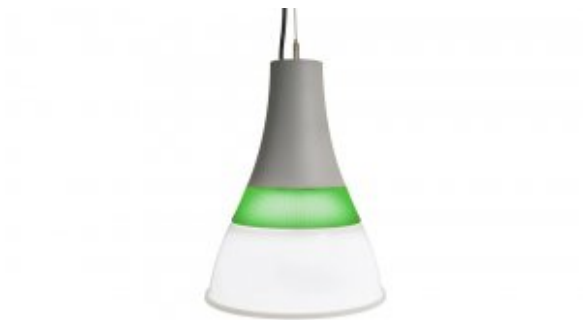
Capo Green Collar