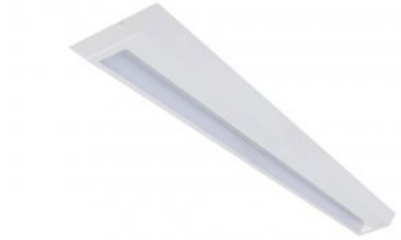
Axant Surface 1200x150