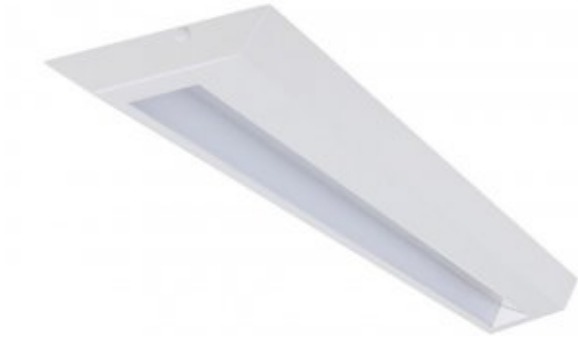
Axant Surface 600x150