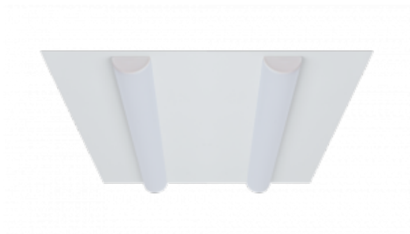
Arcus Flush Duo 600 x 600