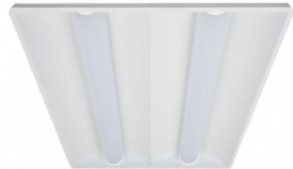
Arcus Duo 1200x600