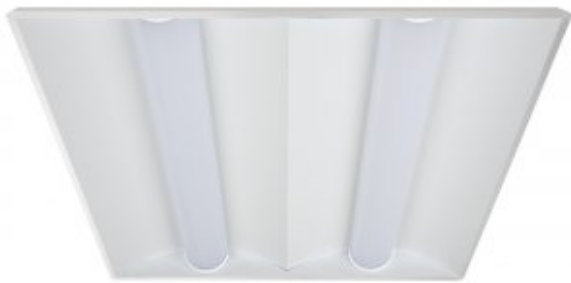
Arcus Duo 600x600