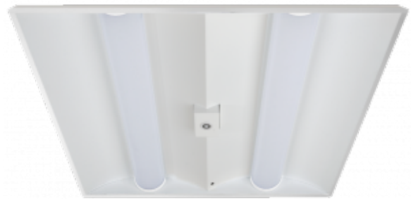
Arcus Duo R44 600x600