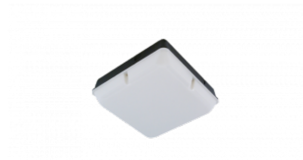
Amenity Plus Metal Square Black