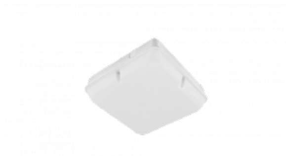
Amenity Plus Metal Square White