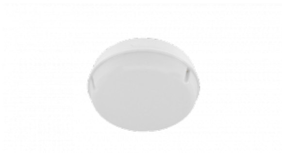
Amenity Plus Metal Circular White