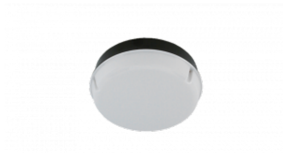
Amenity Plus Metal Circular Black