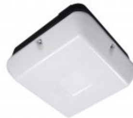
Amenity Plus Square Black