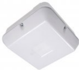
Amenity Plus Square White