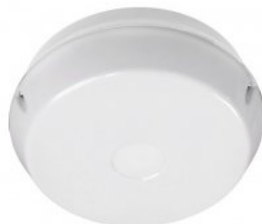
Amenity Plus Circular White