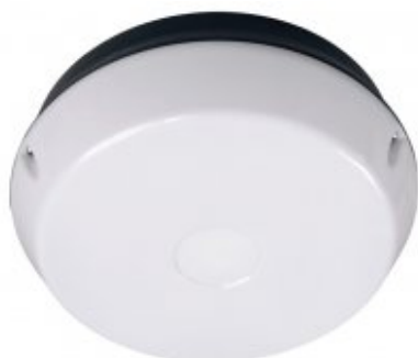
Amenity Plus Circular Black