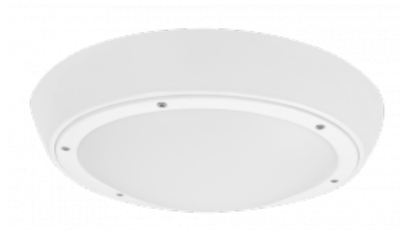
Amenity Decorative Secure