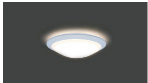
Amenity Decorative Halo Lit