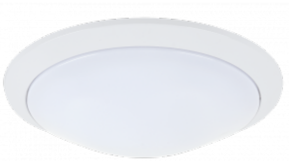
Amenity Decorative Halo