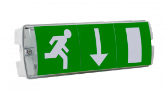
AME Wireless with Legend