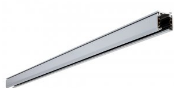
3 Circuit Track Grey