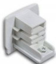
3 Circuit Dead End White