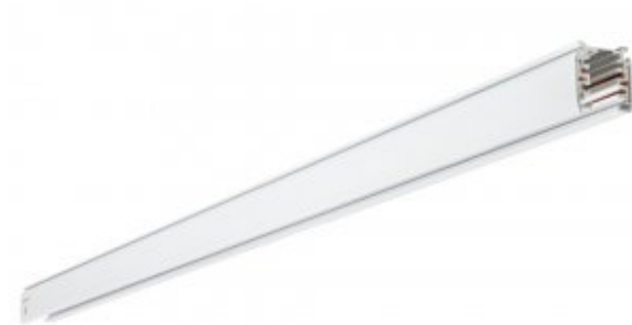
3 Circuit Track White