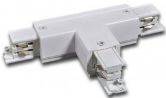
3 Circuit 3 Way Connector White