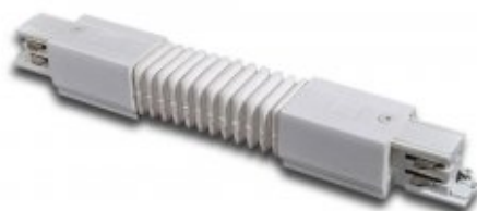
3 Circuit Flexible Joiner White