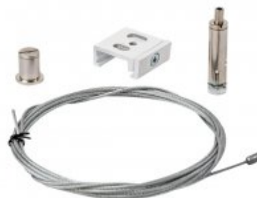
Suspension Kit Solid Ceiling