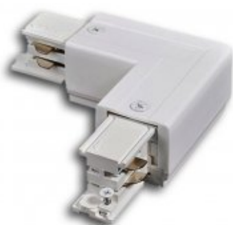
Circuit Corner White