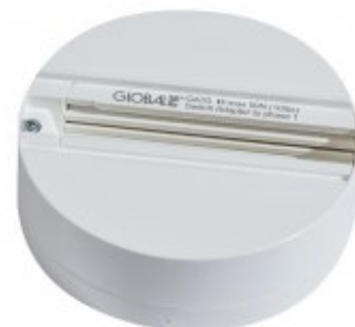
Surface Mount Individual Track