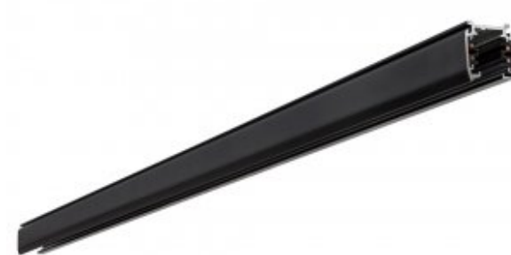
3 Circuit Track Black