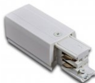
3 Circuit Live End White