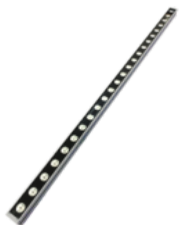
Glide (Temporary Image)