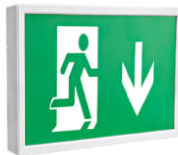
EXI2 LED NM3 ST3