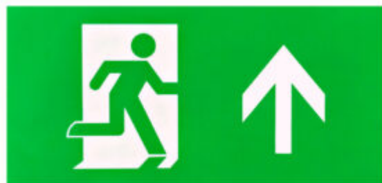
EXI2 UL ISO7010