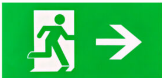
EXI2 RL ISO7010