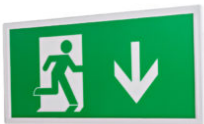
EXI2 LED NM3