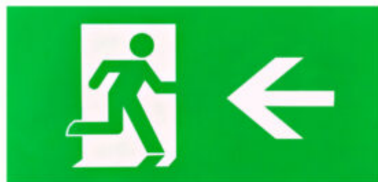
EXI2 LL ISO7010