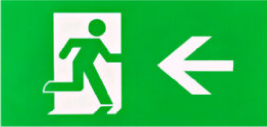
EXI LL ISO7010