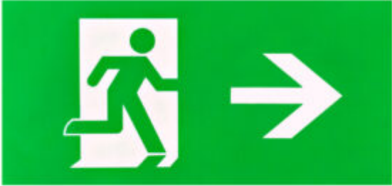
EXI RL ISO7010