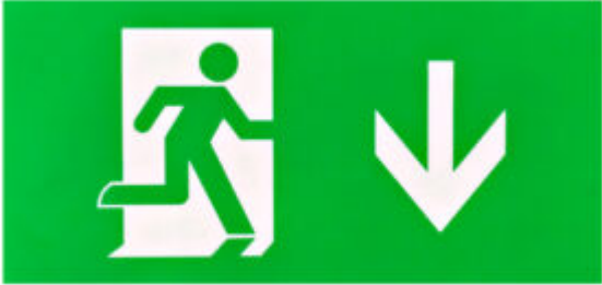
EXI DL ISO7010