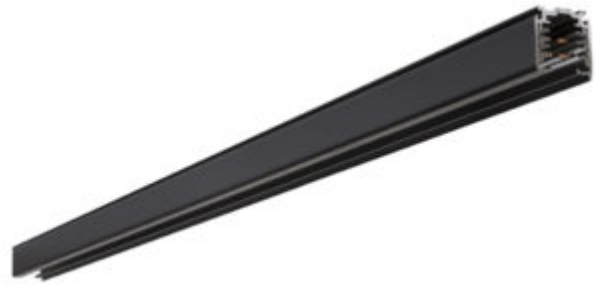
Black Track DALI