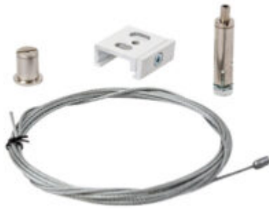
Track Suspension Kit