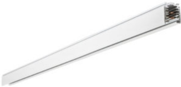
White Track DALI