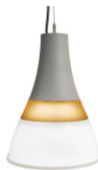
The Capo LED with orange collar