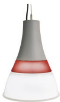
The Capo LED with red collar