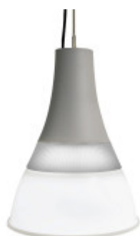
The Capo LED with grey body