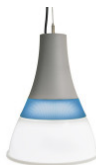
The Capo LED with blue collar