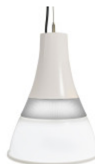
The Capo LED with white body