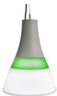
The Capo LED with green collar