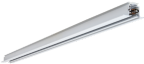
3 Circuit Track Recessed in White