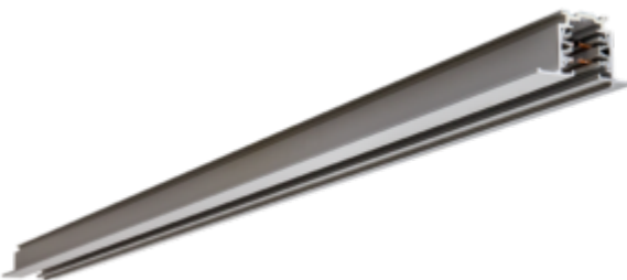
3 Circuit Track Recessed in Grey