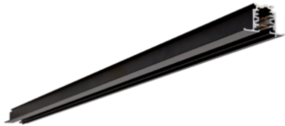
3 Circuit Track Recessed in Black