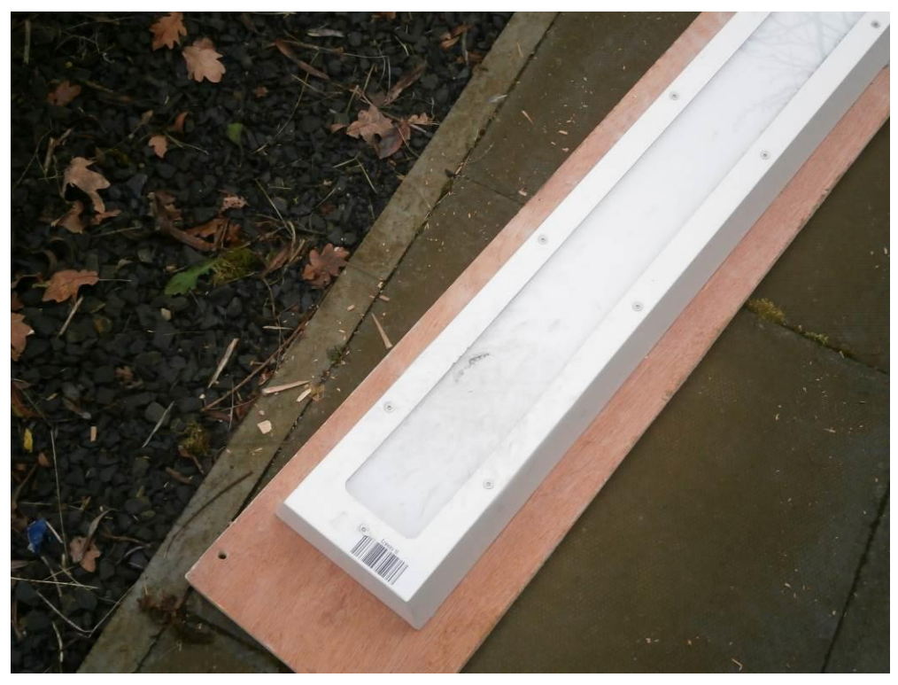
Figure 3. Product Image after the test