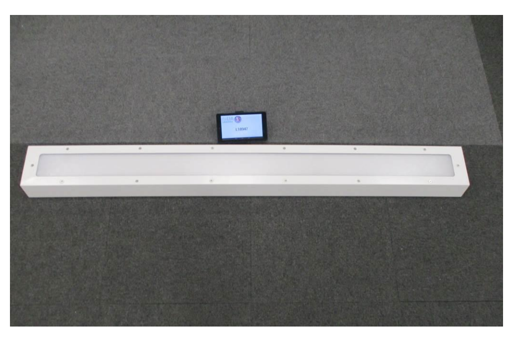
Figure 1. Product Image