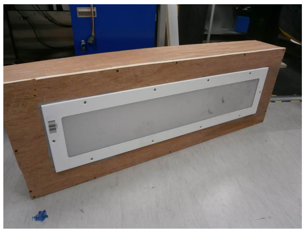
Figure 3. Product Image after the test