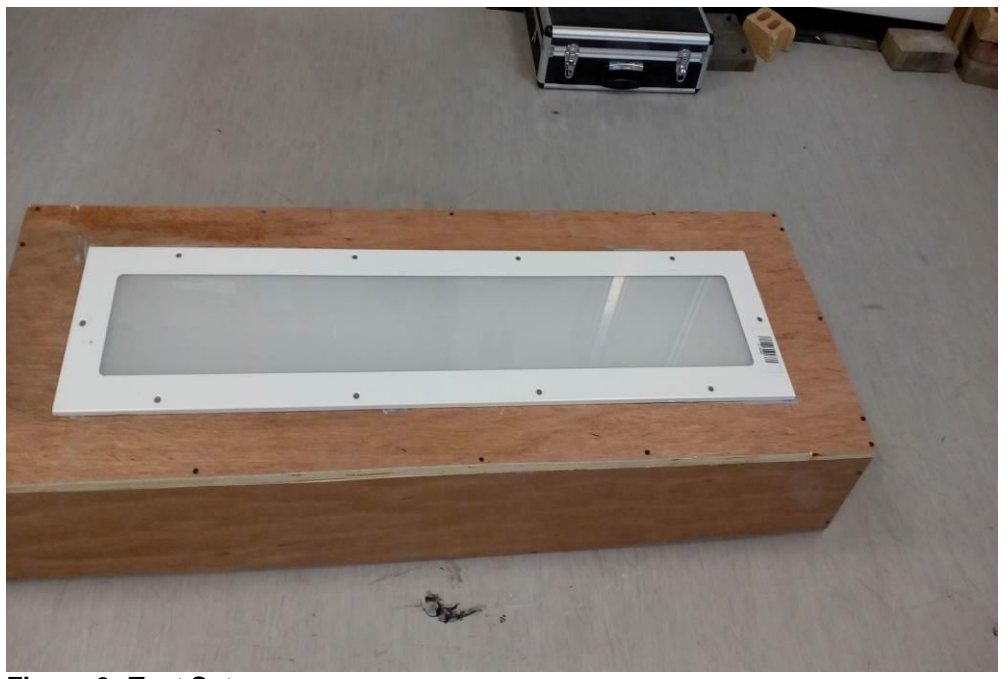
Figure 2. Test Setup